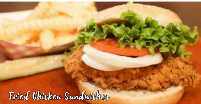
Fried Chicken Sandwiches

Sautéed Seasonal Vegetables, Fresh Cucumber, Lettuce, and Tomato served on Flatbread with Garlic Ranch