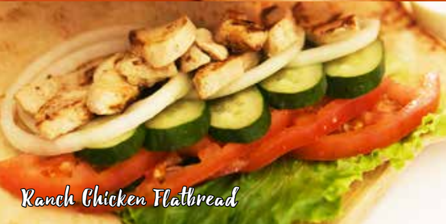
Ranch Chicken Flatbread