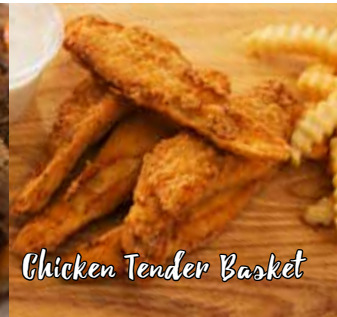
Chicken Tender Basket