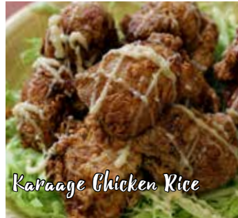
Karaage Chicken Rice