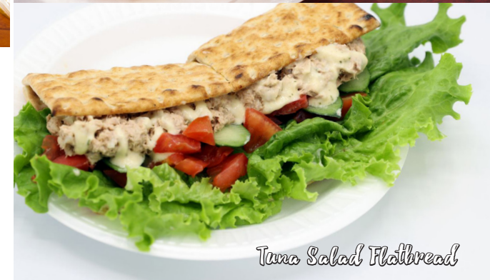
Tuna Salad Flatbread