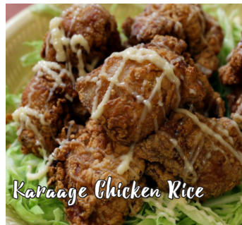
Karaage Chicken Rice

Chicken Tender Basket (1336 cal) .... $8.00