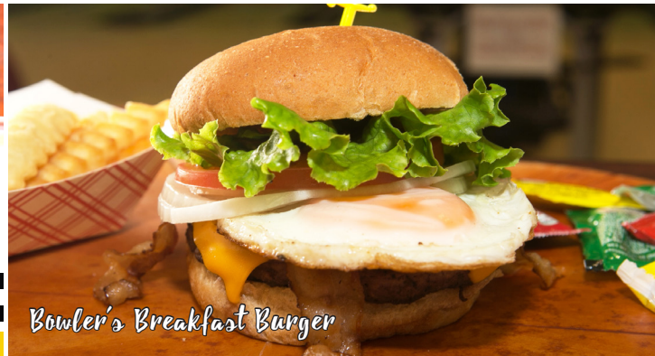
Bowler's Breakfast Burger

Make it a Combo! .....$3.00 Includes Fountain Drink and Choice of Crinkle Cut Fries, Curly Fries, or * Veggie Cup.