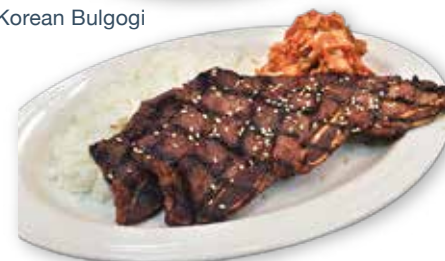
Korean BBQ Short Rib Plate