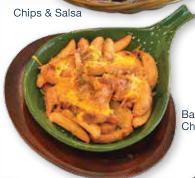
Bacon Cheese Fries