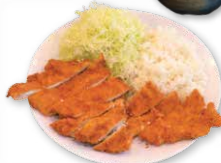
Japanese Chicken Katsu