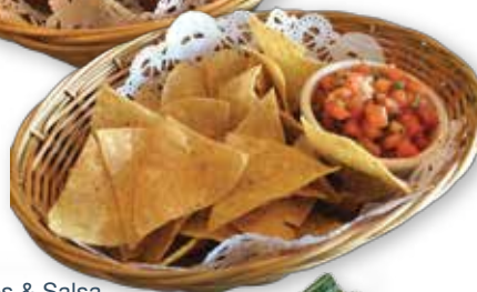
Chips & Salsa