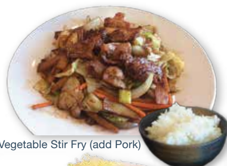
Vegetable Stir Fry (add Pork)