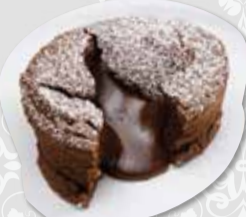
Chocolate Lava Cake