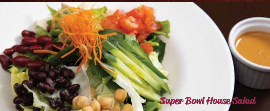
Super Bowl House Salad