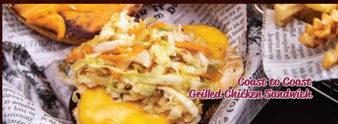
Coast to Coast Grilled Chicken Sandwich

Fresh Baked Homemade Pizza Crust Topped with a Blend of Five Cheese. Additional Toppings $0.75: Pepperoni, Italian Sausage, Ground Beef, Ham, Bacon, Onions and Black Olives