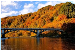
Photo Tour @Nasukarasuyama Sunday, 24 November 2019 Depart: 0500/Return: 1930

Let's go to Tochigi to shoot beautiful scenery and interesting objects. Scheduled locations are as follows; Ryumon Waterfall, Taihei Temple (Koyo & huge Waraji objects), Ochiichi Area (contrast of Koyo, river and bridges, might be able to see salmon swim up the river), Torinokosansyo Shrine (Owl shrine), Cavern Sake Brewery