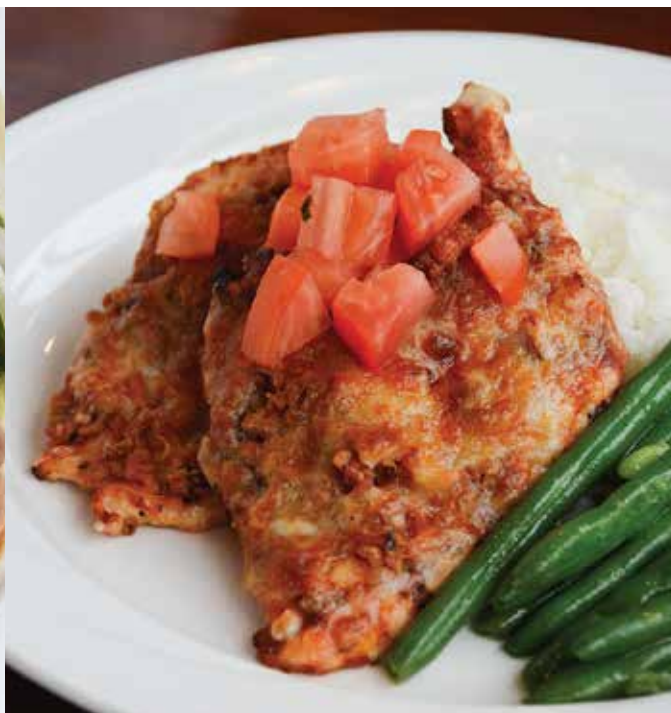
Grilled Chicken Monterey