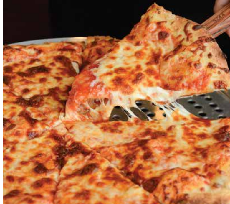
Medium Cheese Pizza