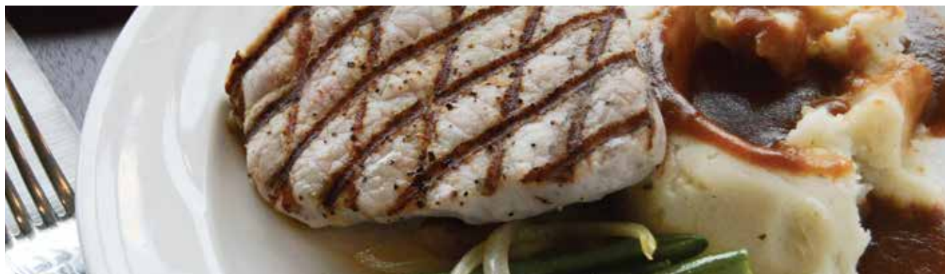
Marinated Grilled Pork Chops

All Entrées served with Side Salad, Vegetable of the Day and Choice of Starch: French Fries, Mashed Potatoes or Steamed Rice