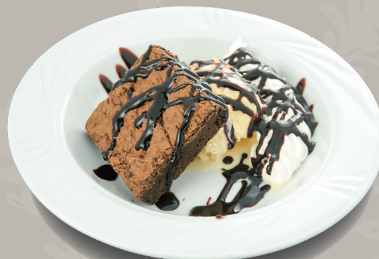
Brownie a la Mode 3.25