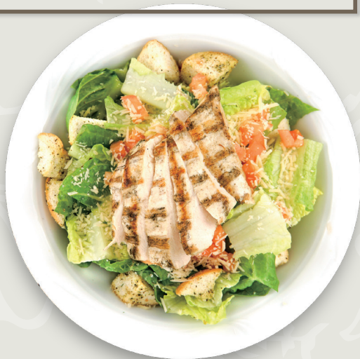
Grilled Chicken Caesar Salad 10.95

A bed of romaine lettuce piled high and topped with grilled chicken breast, tomatoes, parmigiana and homemade croutons