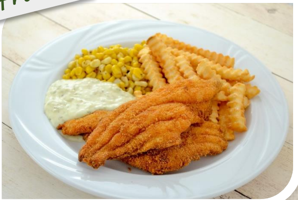
Fried Catfish $8.95