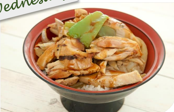
Chicken Don $8.95