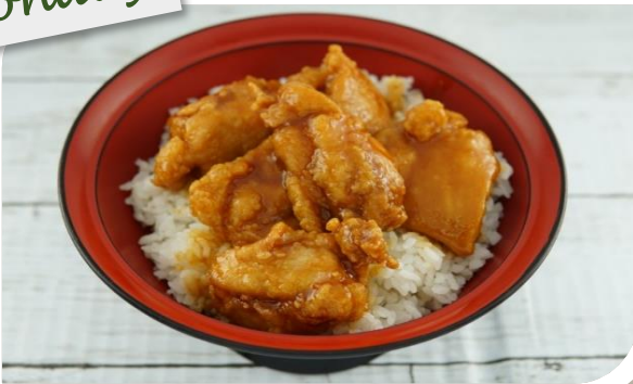
Orange Chicken Don $6.95