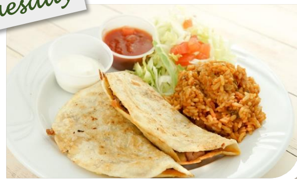
Beef Quesadilla $7.95