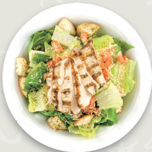
Grilled Chicken Caesar Salad 10.50

A bed of romaine lettuce piled high and topped with grilled chicken breast, tomatoes, parmigiana and homemade croutons