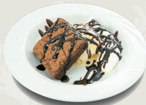
Brownie a la Mode 3.25