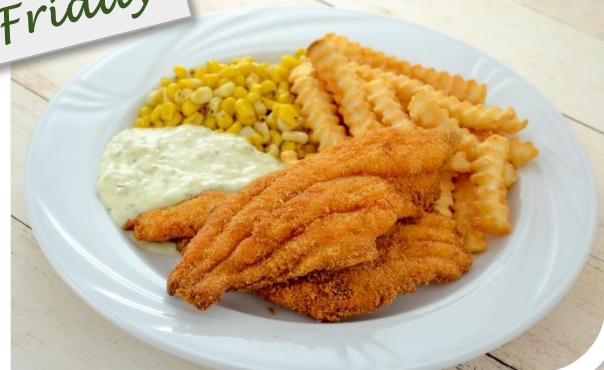
Fried Catfish $8.95