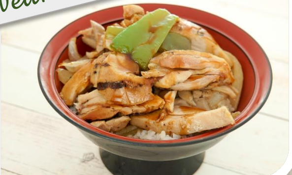
Chicken Don $8.95