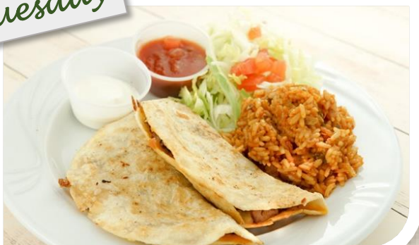
Beef Quesadilla $7.95