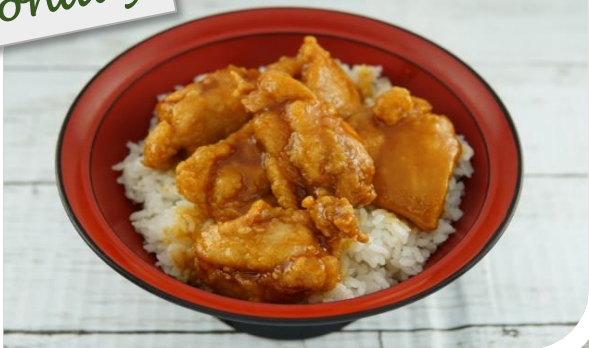
Orange Chicken Don $6.95