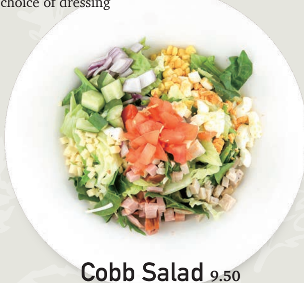
Cobb Salad 9.50

Crispy field greens topped with tomatoes, cucumbers, black olives and onions served with choice of dressing