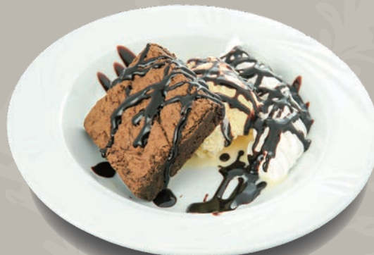
Brownie a la Mode 3.25