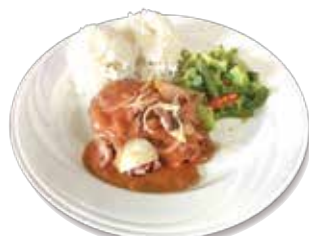
Hamburger Steak Plate

8 oz. of hamburger steak with onion sauce, topped with sunny side egg. Served with rice & hot vegetables.