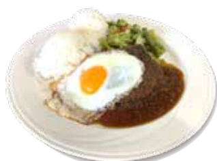
Hamburger Steak Plate Japanese Style